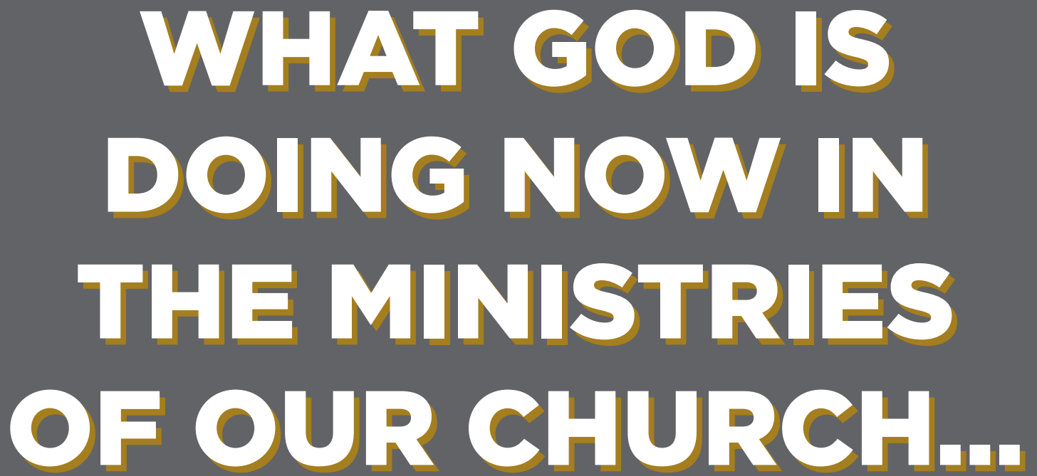
INVESTMENTS IN LOCAL AND INTERNATIONAL MISSIONS